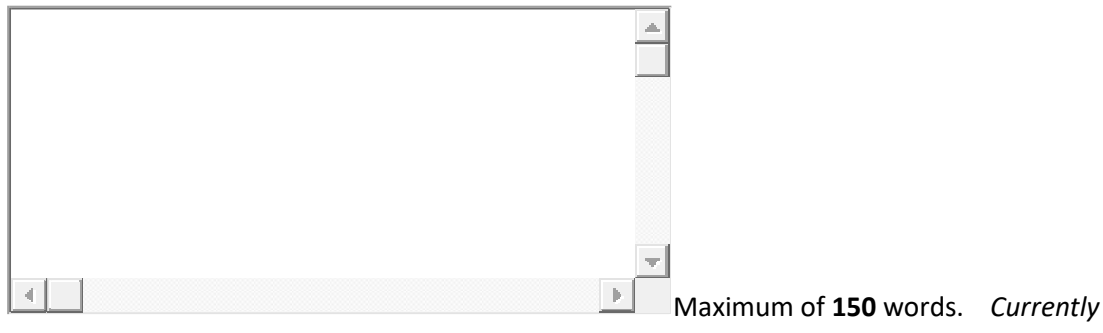
Used: 0 words.

• Current Programs- Tell us what you do and how you do it: *