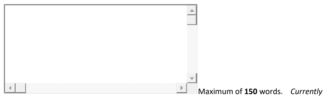
Used: 0 words.

• Current Programs- Tell us what you do and how you do it: *