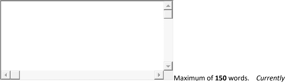
Used: 0 words.

• What difference do you make in the community and for the population(s) you serve? *